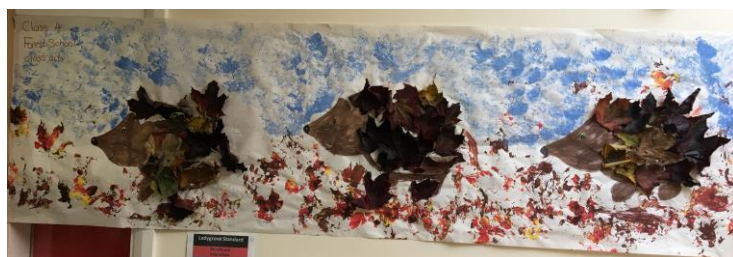
Class 4's forest school artwork this week.

Class 10 worked as a team to make a huge maze just outside forest school this week.